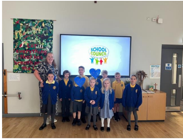
7 - School Council