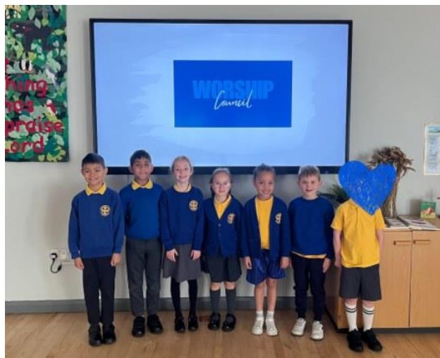
6 - Worship Council