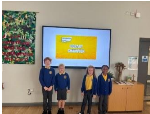
5 - Library Champions