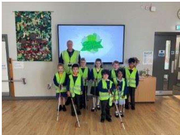
2 - Green Team