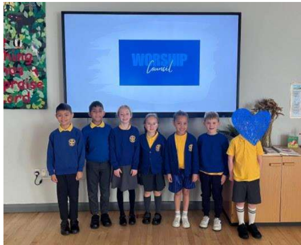
5 - Worship Council