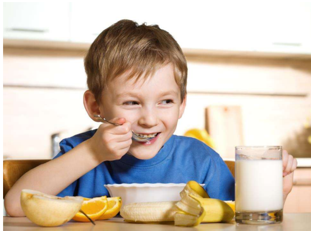
7 - Breakfast Club runs daily, 7:45am - 8:45am

We are pleased to offer our own Breakfast Club (7.45am - 8.45am) and After School Club (3.15pm - 5.30pm) in our school hall. If you have any queries regarding menus or activities, please email wraparound@archbishop.newcastle.sch.uk