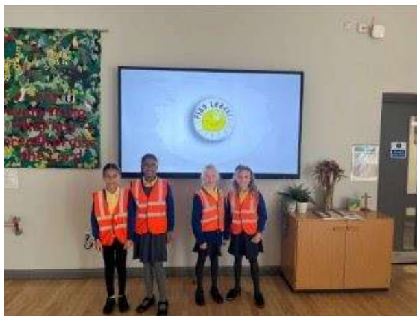
3 - Play Leaders