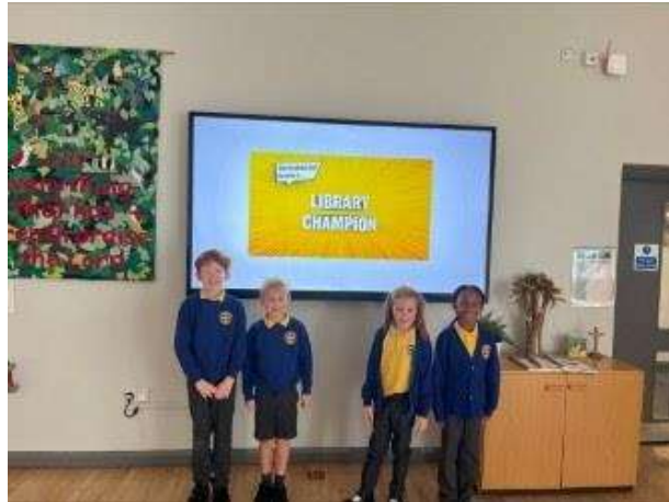
4 - Library Champions