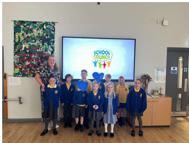
6 - School Council