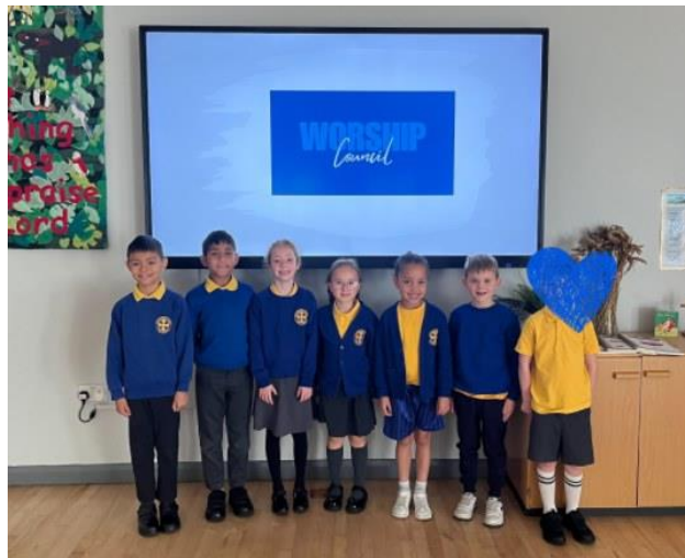
5 - Worship Council