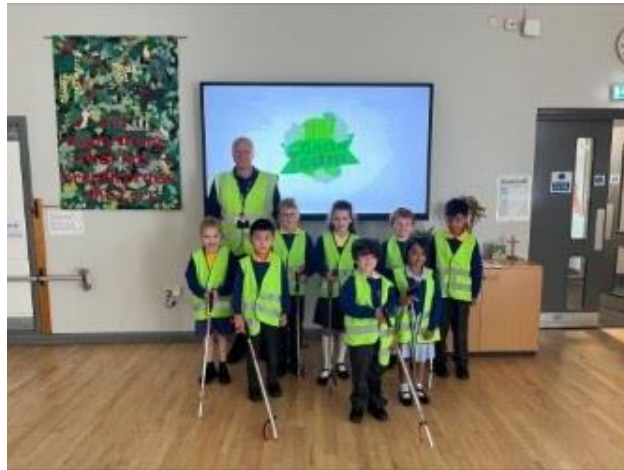
2 - Green Team