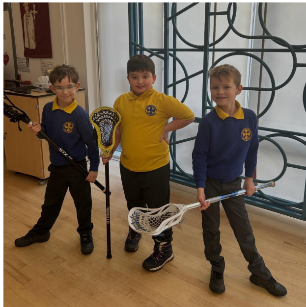
11 - Lacrosse taster sessions in action!