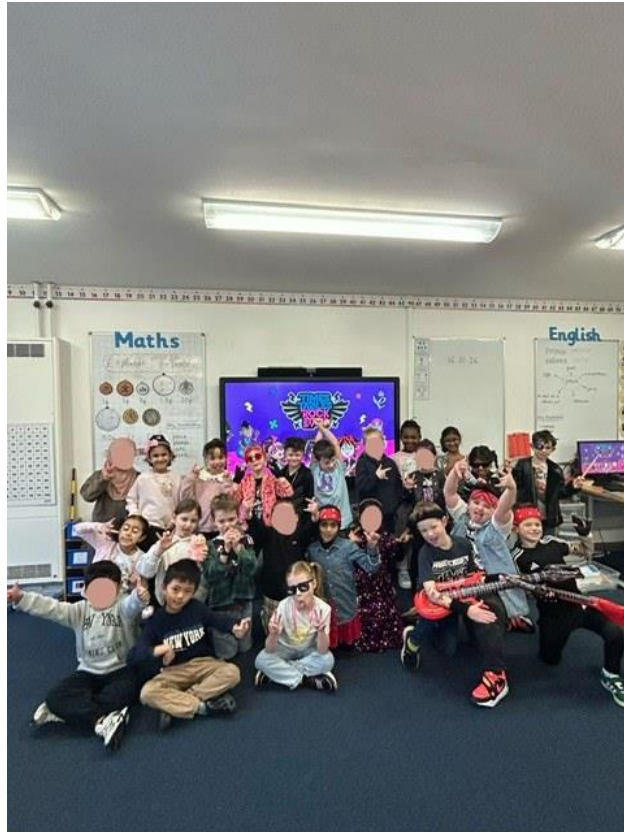
3 - Year 2 looked amazing today!!