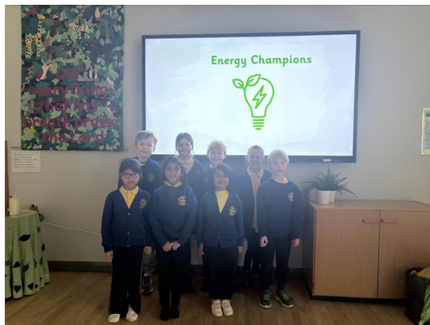
5 - Energy Champions