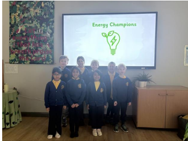
4 - Energy Champions