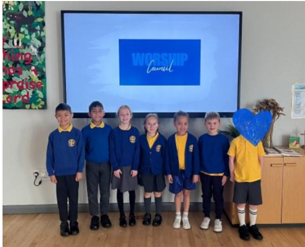
7 - Worship Council