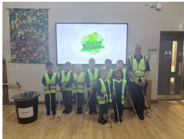
3 - Green Team

By participating in these social action groups, our children develop early leadership skills and a lifelong commitment to social responsibility, recognising that their voices and actions can truly improve the lives of others.