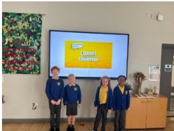
6 - Library Champions