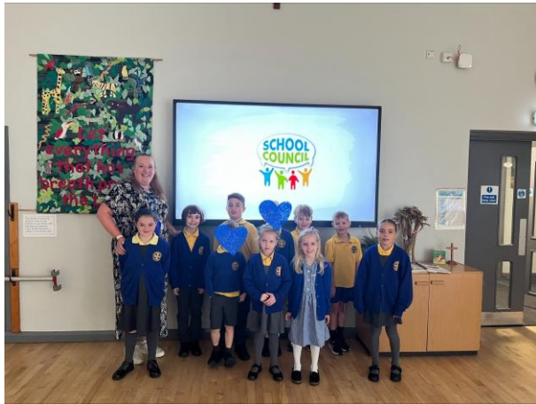
8 - School Council