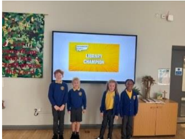
5 - Library Champions