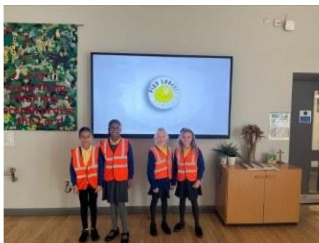
4 - Play Leaders