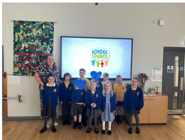
7 - School Council