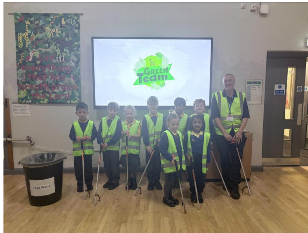
2 - Green Team