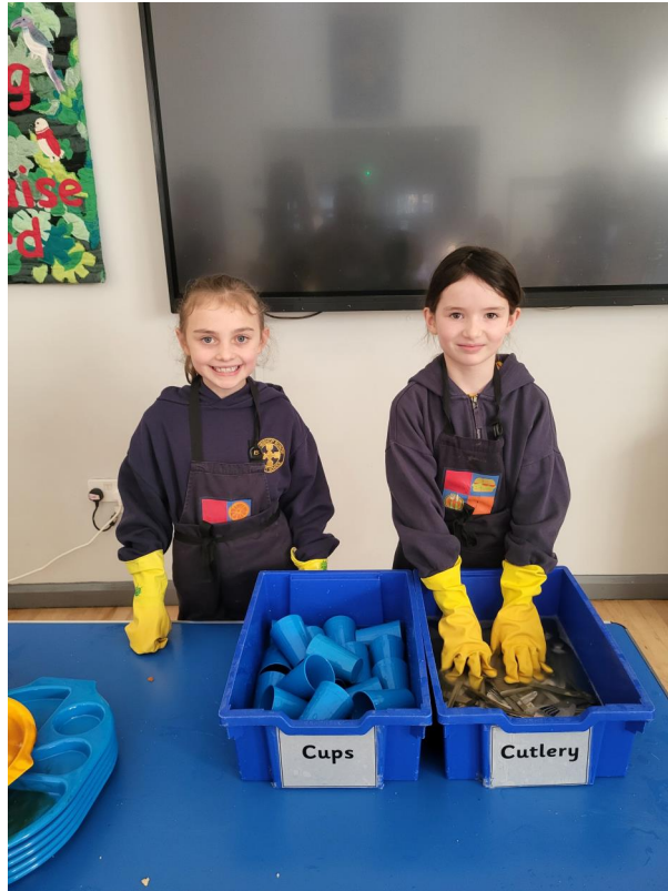
9 - Hall monitors