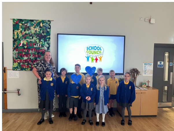
8 - School Council