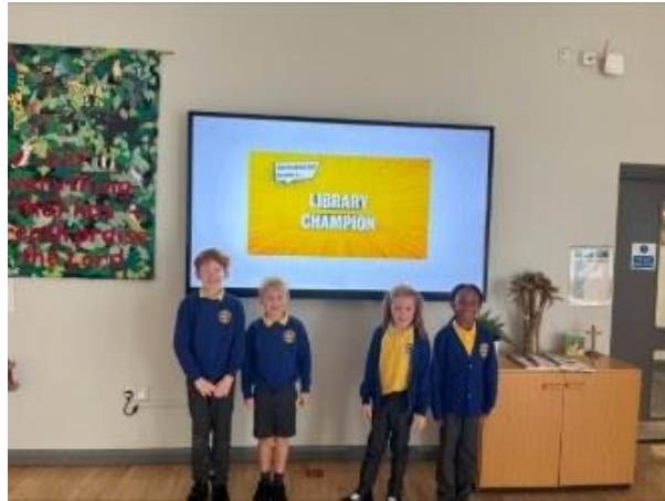
6 - Library Champions