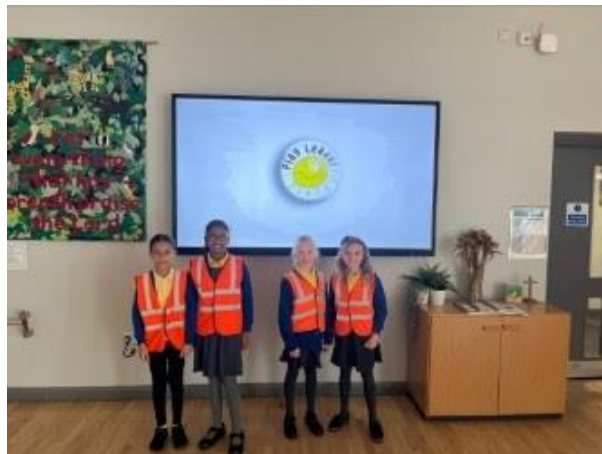
5 - Play Leaders