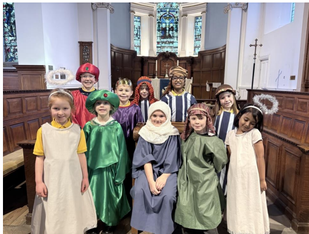
14 - Amazing actors brought the story to life.

The Carol Service this afternoon was a wonderful way to end the term - the choir sang beautifully and our Worship Council read clearly and with excellent accuracy and intonation. Thank you to everyone who joined us!