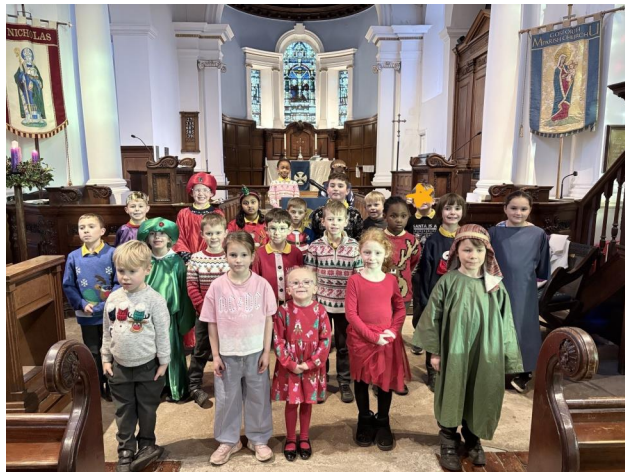
12 - Our wonderful choir who performed this afternoon!