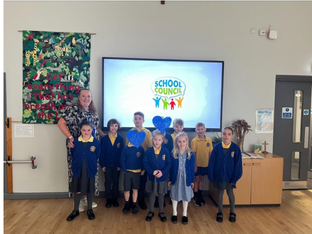
8 - School Council