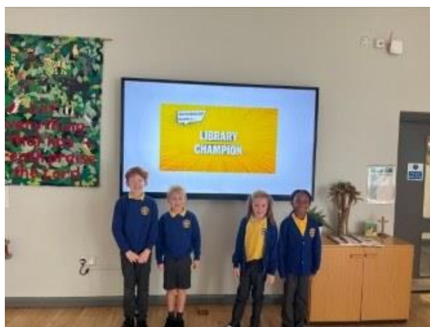
5 - Library Champions