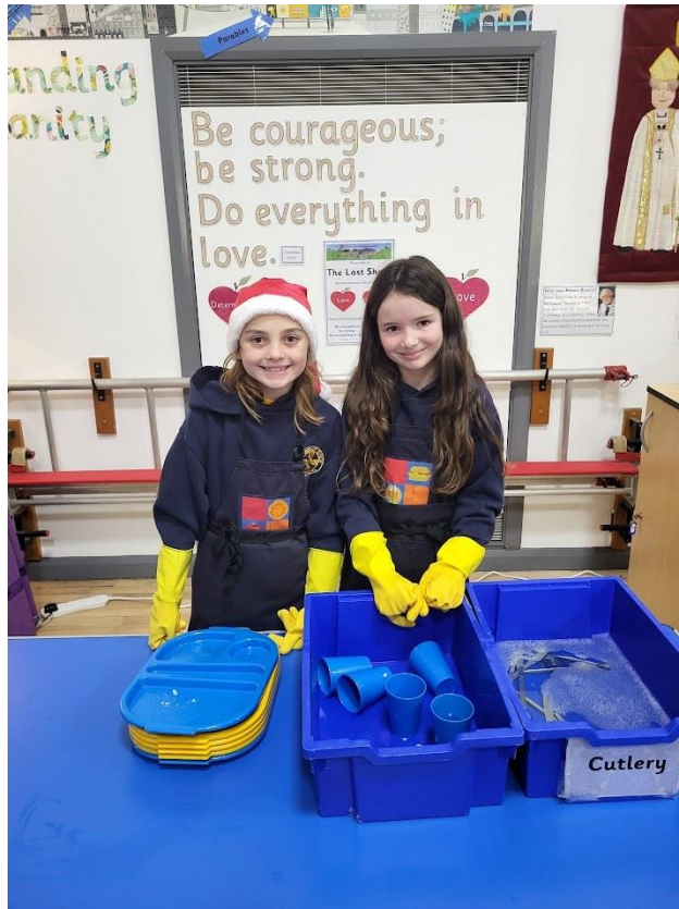
6 - Hall Monitors