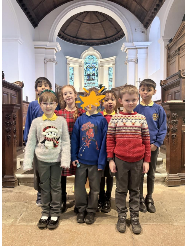
13 - Our fabulous Worship Council who planned and led the service.