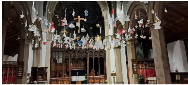
10 - All Saints' Angels

Thursday 25th December at 10am - Sung Eucharist